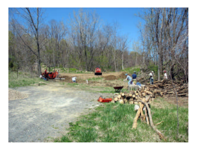
Volunteers working on the parking lot at Clarksville