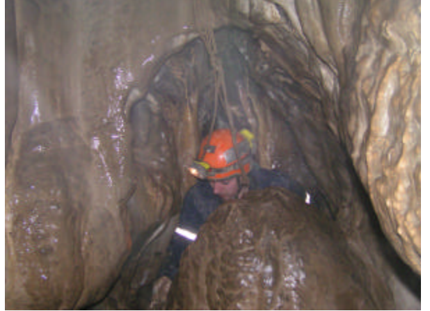
Cavers passed old wood and logs from an upper area of Everett Cave down the drop and out of the cave as part of the cleanup, picture by Peter Youngbaer.

Cavers outside the entrance of Everett Cave during the cleanup before the last board meeting, picture by Peter Youngbaer