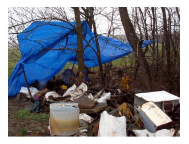
Cavers removing trash from Baugh Cave during a raining Earth Day cleanup

NCC Board Meeting Saturday, June 3rd 2006, 1:00PM at Onesquethaw Fire House, Clarksville NY Cleanup of Clarksville Cave starting at 9 AM