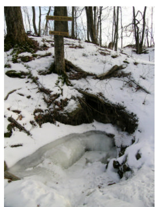
Halls Hole, iced over! (2-19-05)