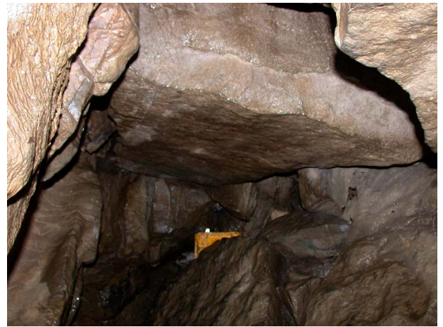
The questionable rock slab (on top), looking towards the Ward's entrance from inside the cave on 10-29-03