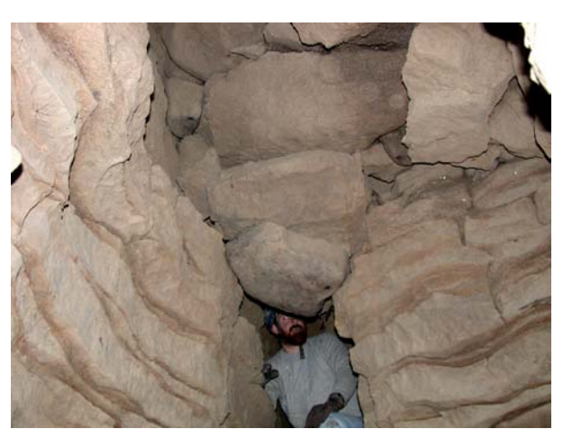
Chockstone at Levy's Cave

July 12-16, 2004: NSS Convention in Marquette, Michigan.