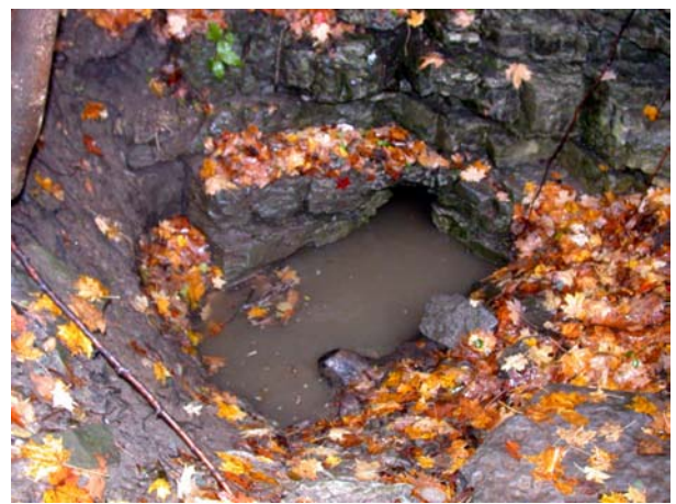
Gregory Entrance of Clarksville at 10-29-03