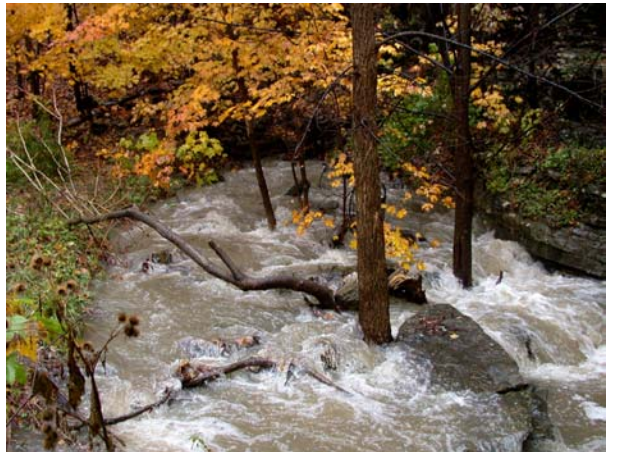
Gregory entrance of Clarksville on 10-29-03, 12:30PM