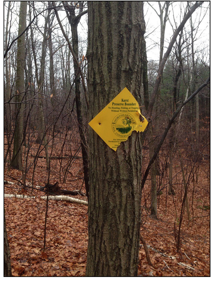
Yum! Boundary Markers at the Merlins Preserve.