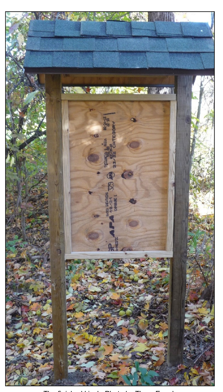
The finished kiosk.