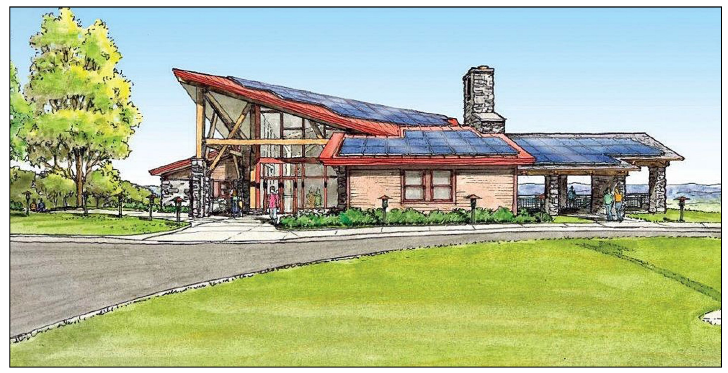
Artist's conception of the completed Thacher Park Visitor Center.

Education is an important mission of the NCC. Indeed, it is the reason we are a non-profit. Helping to fund the cave and karst exhibits at the visitor center would further our mission and will, in my opinion, reach more people than we do at our preserves. To that end, between now and April 2016, I will match each dollar up to $5,000.00 raised by the NCC for the Visitor Center displays. Please send your tax deductible contribution earmarked for the Visitor Center to the NCC Office.