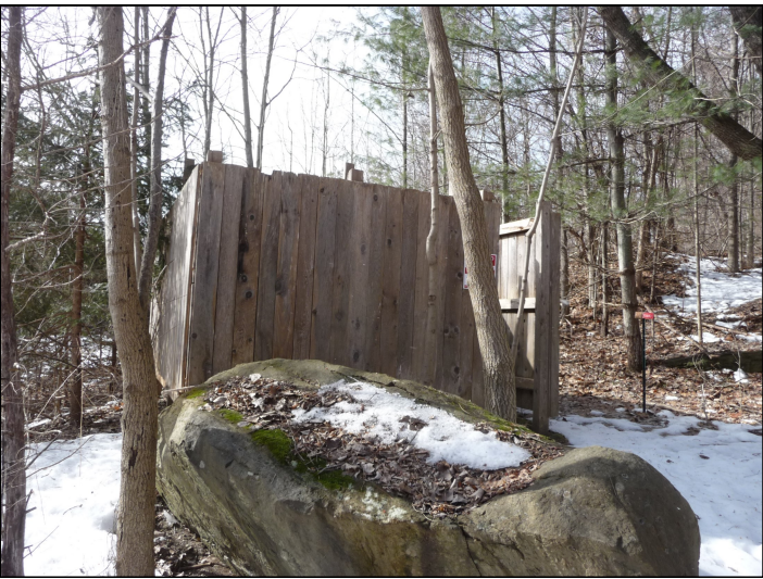
The changing area at Clarksville Cave in 2005 (left) and 2022 (right). A closeup of damage detail can be seen below.