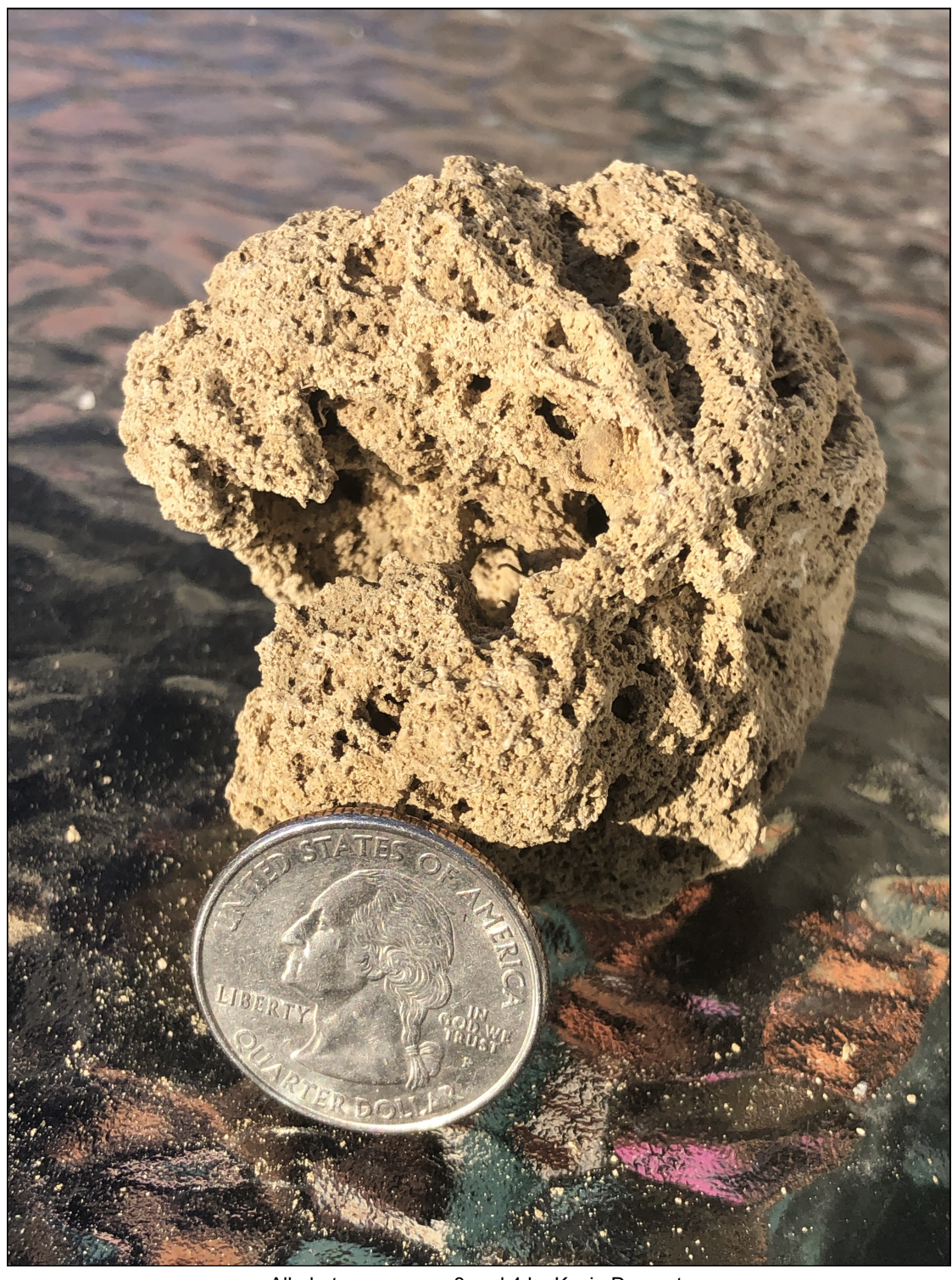
All photos on pages 3 and 4 by Kevin Dumont.