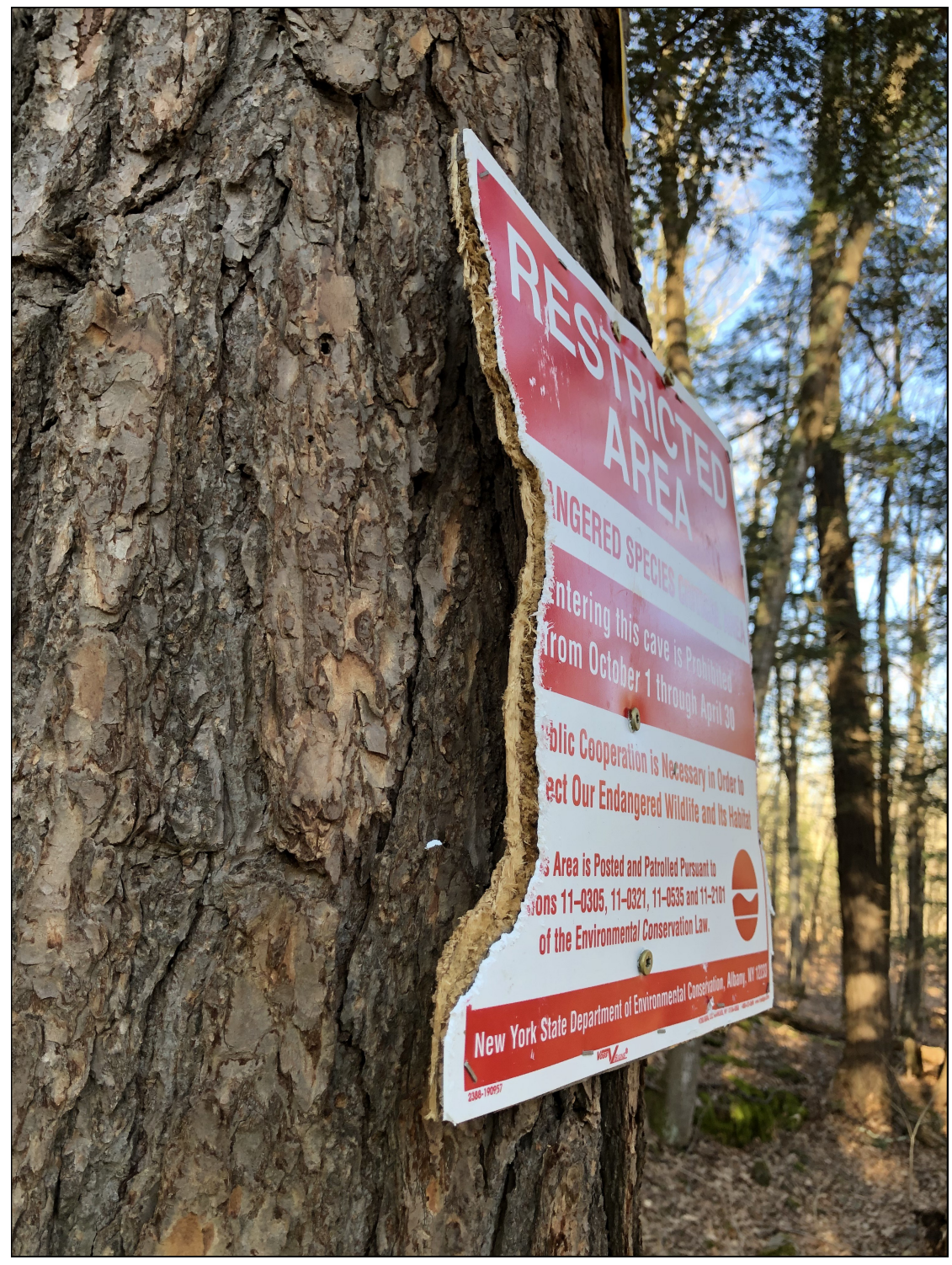
Porcupine damage to the NCC sign near the Ward Entrance to Clarksville Cave.