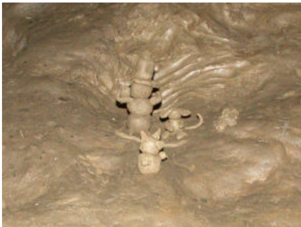
Mud figures in Clarksville Cave (Figures by ??)