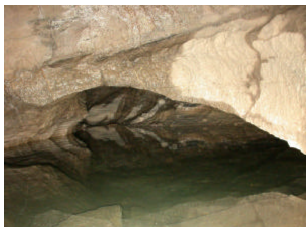
The Bathtub in Clarksville Cave