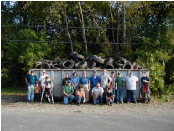
Cleanup crew from Cayuta Creek

July 12-16, 2004: NSS Convention in Marquette, Michigan.