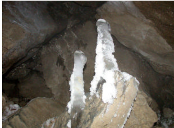
Ice formations in Clarksville Cave