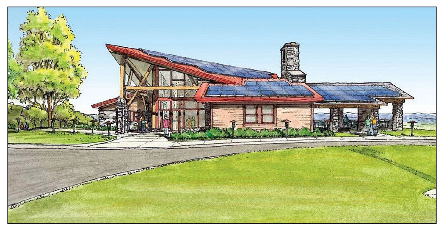
Artist's conception of the completed Thacher Park Visitor Center.

Education is an important mission of the NCC. Indeed, it is the reason we are a non-profit. Helping to fund the cave and karst exhibits at the visitor center would further our mission and will, in my opinion, reach more people than we do at our preserves. To that end, between now and April 2016, I will match each dollar up to $5,000.00 raised by the NCC for the Visitor Center displays. Please send your tax deductible contribution earmarked for the Visitor Center to the NCC Office.