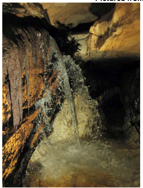
Growling Bear Cave waterfall