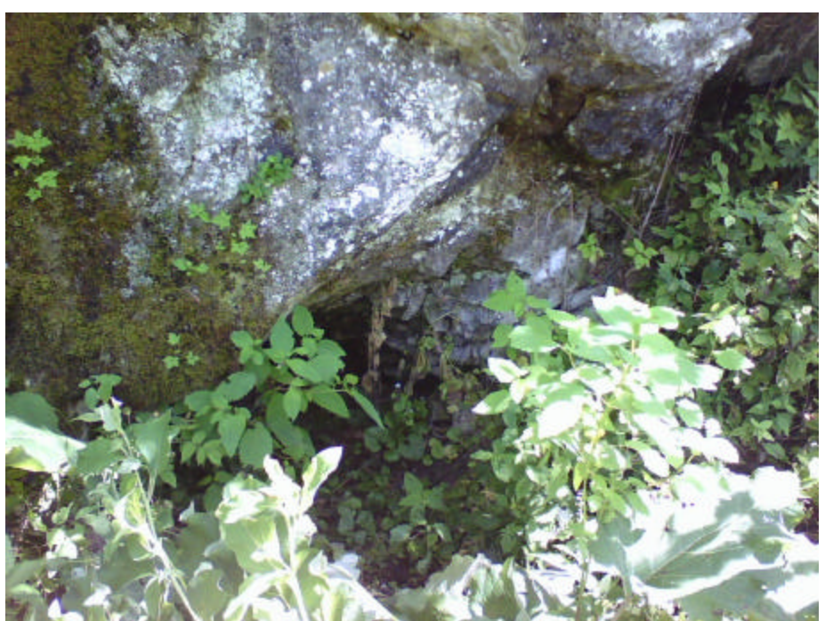
Entrance to Dry Valley Cavern, located on the Bentley's Cave Preserve

August 8<sup>th</sup>, 2009: NJ Tri-state Speleological Society presents <u>www.benefit4thecaves.com</u>